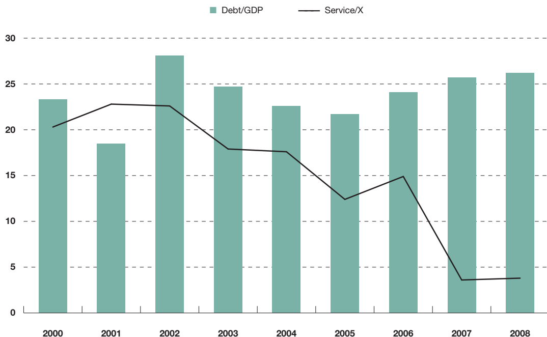
Figure 3 - Stock of Total External Debt (percentage of GDP) and Debt Service (percentage of exports of goods and services)

Foreign direct investment (FDI) is heavily biased towards the mining sector, which attracted 65 per cent of major projects in the 2003-06 period. In manufacturing, most Asian FDI has been short-lived. Rhino Garments shut down in 2005, while Ramatex has used the threat of doing the same to win new concessions from the trade unions and the government (in particular in the area of environment controls). A revision of the investment legislation is currently under way, in order to define better the role of tax incentives – which, in the case of Ramatex, included